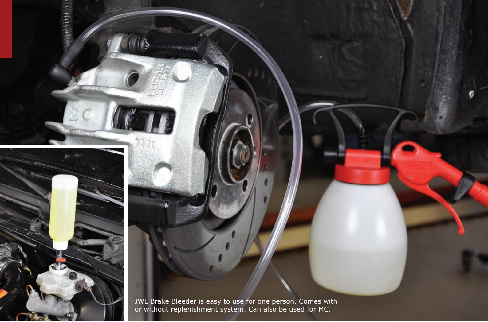
JWL Brake Bleeder is easy to use for one person. Comes with or without replenishment system. Can also be used for MC.